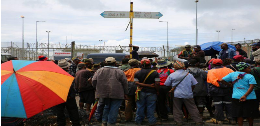
Fig 4 Fasu tribe protested over land boundary encroachment by Huli at Moran PDL area.

With lack of updated geographical names surveyors do not do proper land search and end up doing duplicate surveys or inaccurate positioning of the survey.